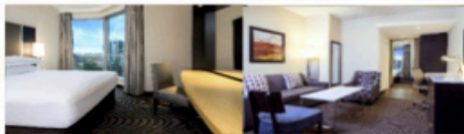
Standard Suite King Bedroom and Living Room